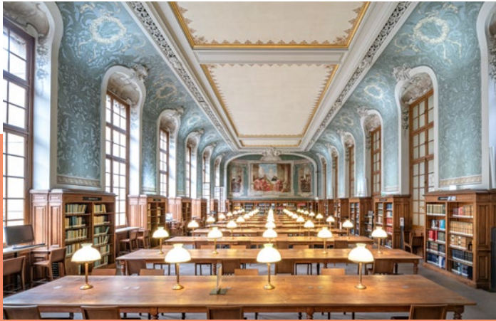
The grand Jacqueline de Romilly Room in the Sorbonne Inter-university Library (BIS).