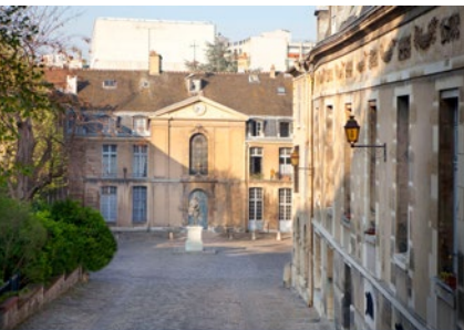
View of the Colbert Courtyard at the Gobelins Manufactory, seat of the Campus (13 th arrondissement)

The Campus is managed by the École nationale supérieure des arts appliqués et des métiers d'art (ENSAAMA) and is involved in a special partnership with the Mobilier national (French institution in charge of the protection of the national cultural movable heritage) which is also a founding member of the project. The Campus acts as a unique center for reflection and exchange of ideas and plays a key role in the development and promotion of excellence in training. Designed as a real incubator of talent and innovation, it caters to several thousand students who pursue their studies towards a baccalaureate degree or at post-baccalaureate level, always in keeping with the requirements of the creative sector.