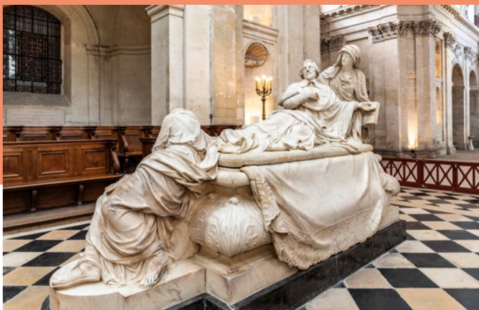
Cardinal de Richelieu's tomb, a masterpiece of French classical funerary sculpture by François Girardon.