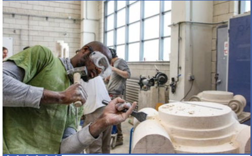
A student of Lycée des Métiers Hector Guimard (19 th arrondissement) where he studies stone cutting).

In the current endeavor to make vocational education more attractive, these events represent an opportunity for students, teachers and industry professionals to showcase the wide range of vocational training programs available in the Académie de Paris as well as employment opportunities. They all have the same goal: encouraging the transmission of vocational skills and promoting the satisfaction of a job well done.